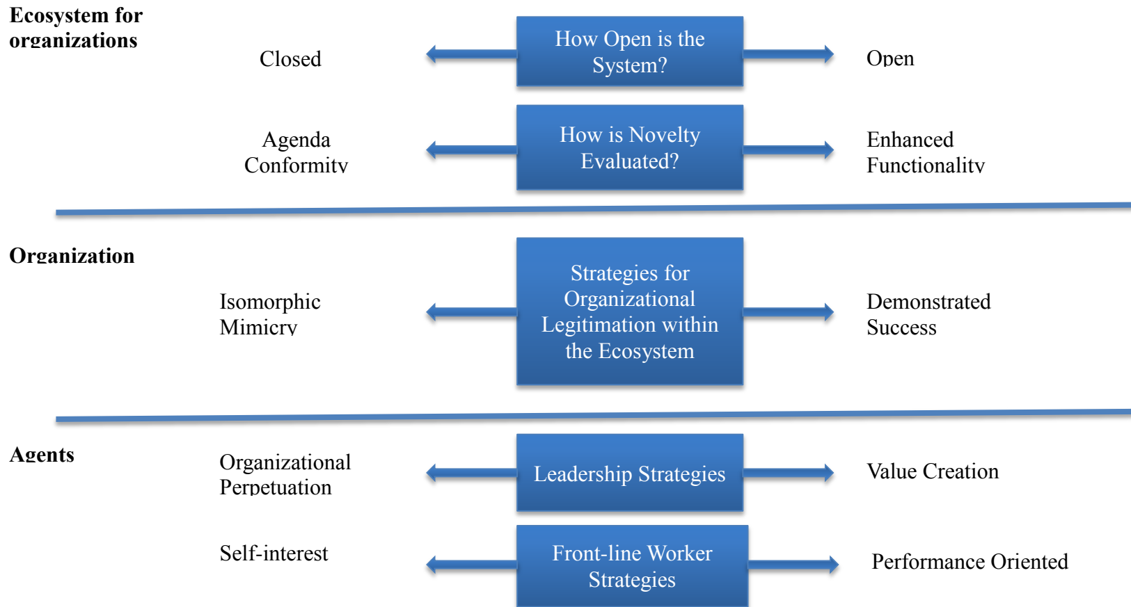
Figure 1. Tensions playing out at different levels of engagement in development